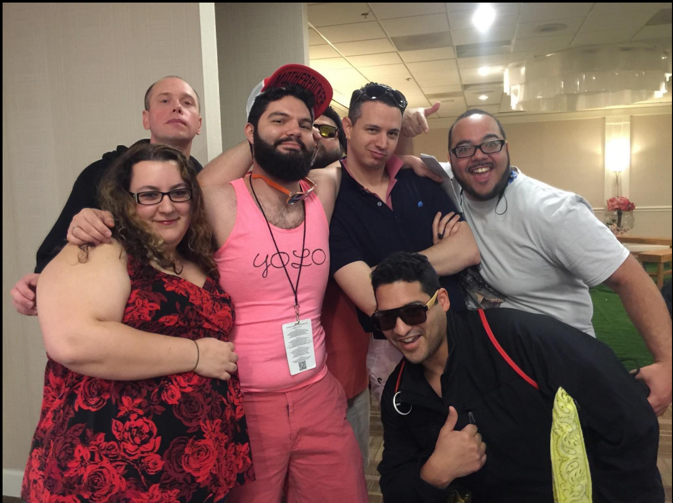
Werewolf Pack: House Alpha Sigma Sigma